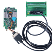
③ I/O cable with DB-15 connector (30-21621-0000-A0)