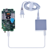
① AI Camera Dev Kit & USB Type-C power supply (90-20075-000E)